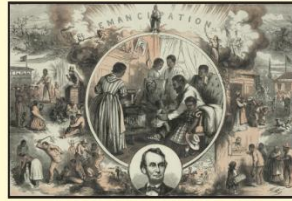
"Emancipation" illustrated print by Thomas Nast depicting life before and after emancipation. Originally printed in Harper's Weekly on January 24, 1865.

By June 1865, Gen. Granger was stationed at Galveston, Texas. On June 19 he signed an order that notified everyone in the state that "all slaves are free." The Emancipation Proclamation had been released two and a half years earlier and ratification of the 13th Amendment was underway by the time Granger signed his order. Nonetheless, news