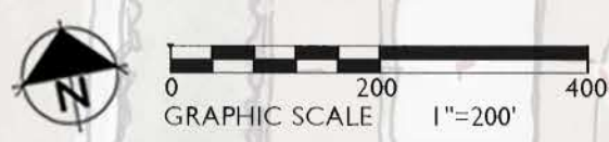
CPS - OLD CHARLOTTE PIKE CONCEPT PLAN May 24, 2021