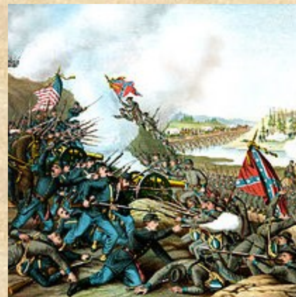
Battle of Franklin, November 1864

Bus costs (maximum of $150 per bus) will be reimbursed to the school or district upon submission of expense documentation after the Signature Event concludes.