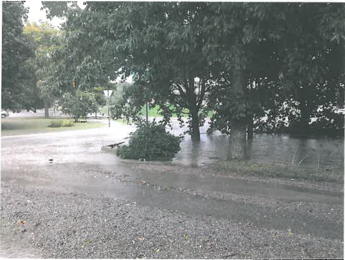
1500 Figuers Drive – Flooding on 08/11/13