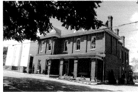
108 Bridge Street Central Commercial, FFO