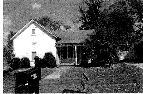
236 Third Avenue N Office Residential, FFO