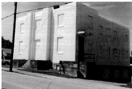
112 Bridge Street Central Commercial, FFO