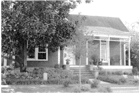
245 Third Avenue N Office Residential, FFO