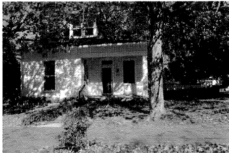
232 Third Avenue N Office Residential, FFO