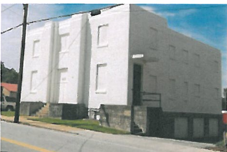
112 Bridge Street Central Commercial, FFO