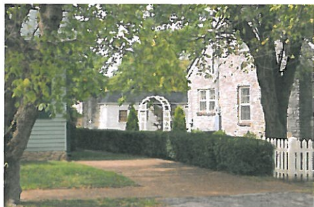
223 Fourth Avenue N Office Residential, FFO