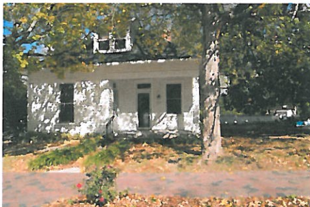
232 Third Avenue N Office Residential, FFO