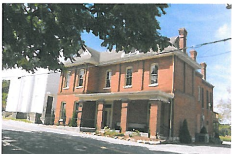
108 Bridge Street Central Commercial, FFO