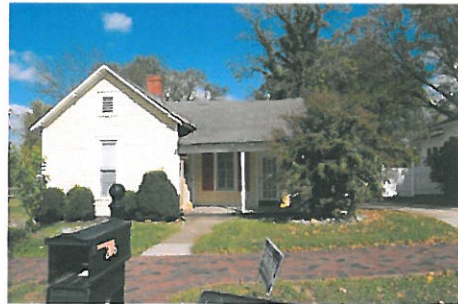
236 Third Avenue N Office Residential, FFO