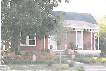
245 Third Avenue N Office Residential, FFO