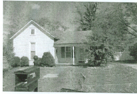
236 Third Avenue N Office Residential, FFO