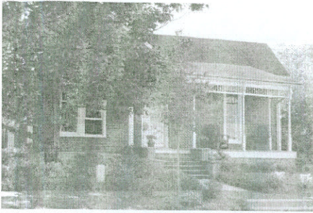
245 Third Avenue N Office Residential, FFO