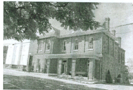
108 Bridge Street Central Commercial, FWO

Contributing historic structures (with nonresidential uses) include the five shown above in the FFO. They are located on Third Ave. N. and Fourth Ave. N. within the HPO. A sixth impacted structure is the Old, Old, Old Jail on Bridge Street, which is partly located in the FFO and FWO.