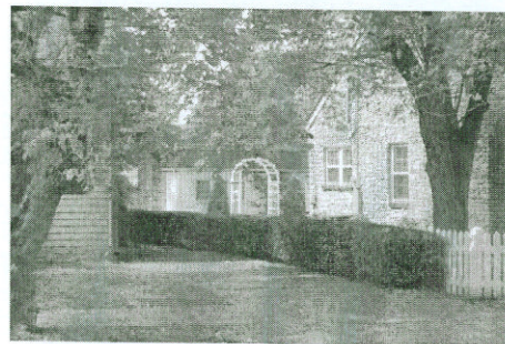
223 Fourth Avenue N Office Residential, FFO