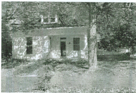
232 Third Avenue N Office Residential, FFO